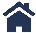
Home & Family